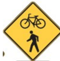
Figure 7c. Trail Crossing Warning Sign (W11-15)