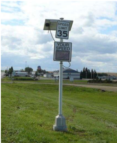
Figure 4. RSFS with Speed Limit sign installed in Selby, SD

Definition: Radar Speed Feedback Signs (RSFS) are installed to provide a real-time dynamic display of a driver's speed at a location where speeding has been documented to be a problem. When the RSFS is activated, the display format will not include animation, rapid flashing, or other dynamic elements.