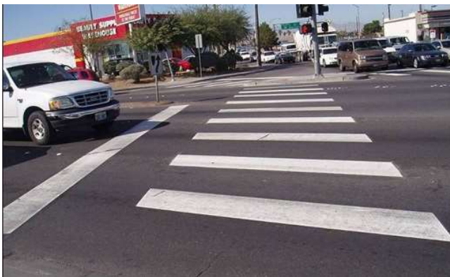
Figure 20. High-visibility crosswalk striping

Visibility at crosswalks may be enhanced by a variety of striping designs (i.e. ladder, continental, bar pairs) that are highly recommended at midblock pedestrian crossings. The different striping designs make it easier for an approaching motorist to see the crosswalk.