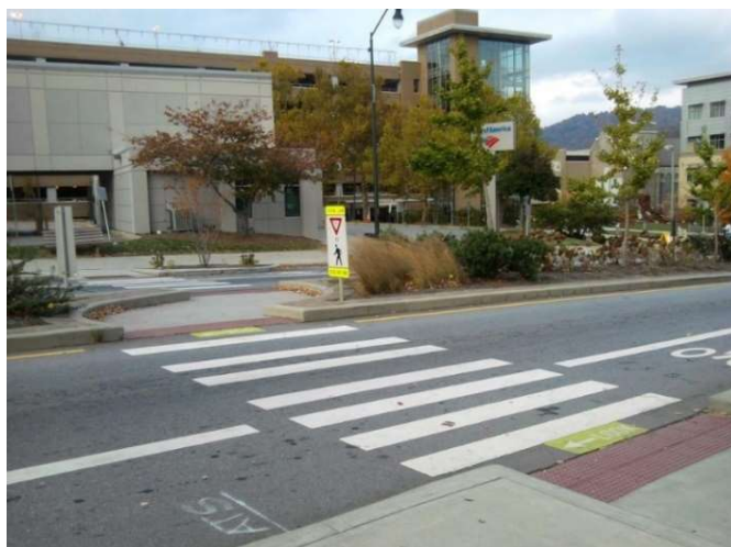
Figure 19. Pedestrian Refuge Island

A Pedestrian Refuge Island is typically constructed in the middle of a 2-way street and is highly desirable for midblock crossings with four or more lanes. The minimum width of a Pedestrian Refuge Island is 6 feet. Installing such raised channelization on approaches to multi-lane intersections has been shown to be especially effective in enhancing safety at uncontrolled and mid-block crossings.