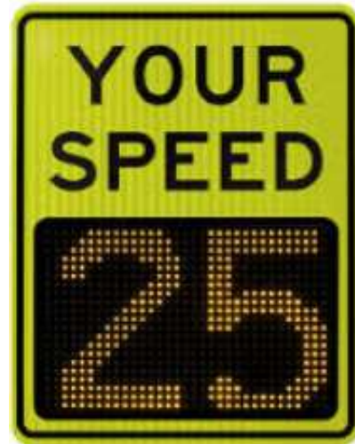
Figure 5. Close up of typical School Zone RSFS

RSFS are typically used at locations where a speed limit transition occurs or in an area where driving the appropriate speed for the highway conditions is particularly critical, such as around school speed zones, or as drivers enter lower speed zones in municipalities. Because law enforcement agencies cannot be expected to constantly monitor speeds in a location, the RSFS serve to supplement regular enforcement of speed limits alerting drivers to specific driving behavior.