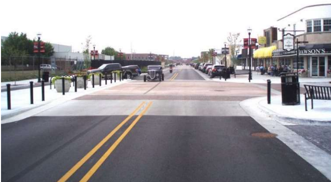
Figure 13. Raised Intersection

Definition: A Raised Intersection is a raised area (flush with sidewalk/shared use path) that covers the entirety of the intersection allowing for a safe, slow-speed crossing at public intersections. A Raised Pedestrian Crossing is also a raised area (flush with sidewalk/shared use path) that covers the entirety of the crossing allowing for a continuous, safe crossing for pedestrians.