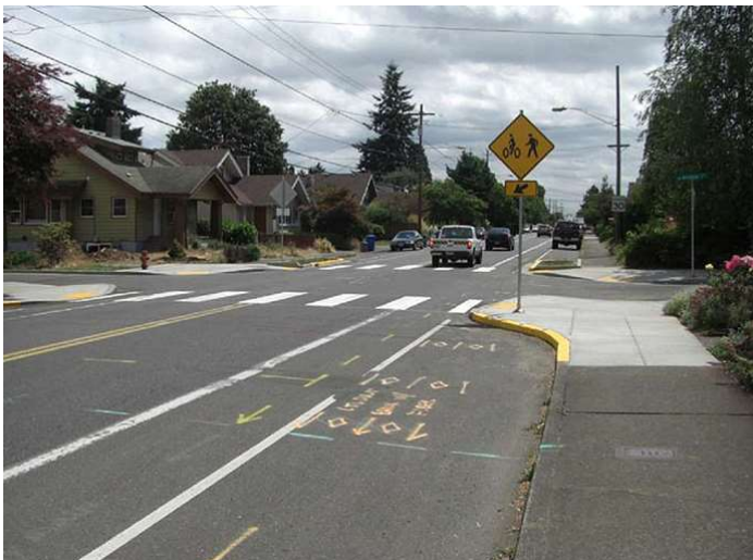
Figure 15. Curb Extension

Refer to the Curb Extension section of the NACTO Urban Street Design Guide for additional guidance on Curb Extensions.