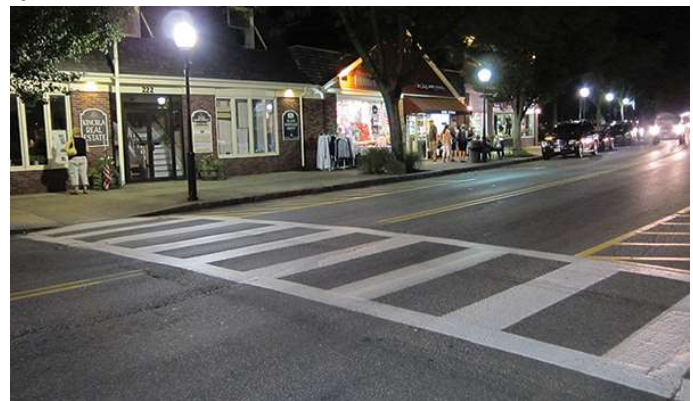
Figure 21. High-visibility crosswalk lighting

Parking restrictions should also be considered adjacent to pedestrian crossings. The minimum setback is between 20 and 30 feet depending on vehicle speed. Curb extensions may also be used in conjunction with a parking restriction to allow enhance visibility at crosswalks.