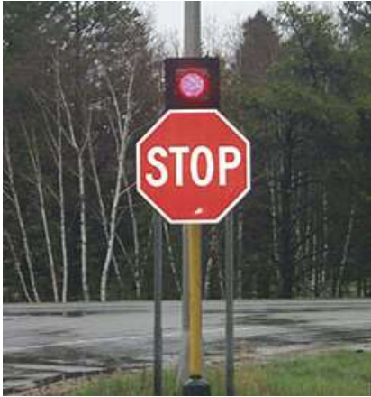
Figure 1a. Stop Sign with Stop Beacon