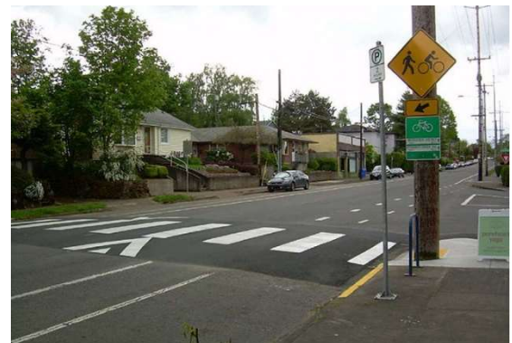
Figure 14. Raised Pedestrian Crossing