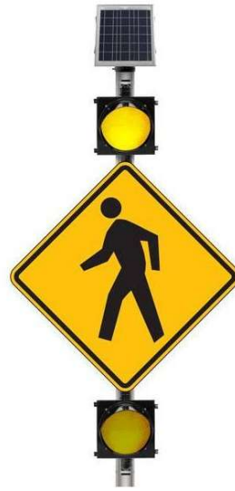
Figure 1b. Warning beacon with pedestrian warning sign