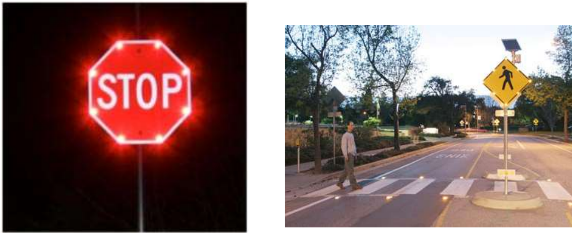
Figure 10. Example of LED Enhanced signs (Stop Sign and Pedestrian Crossing Sign)

Chapter 2A of the MUTCD contains design and installation information on LED Enhanced Signs.