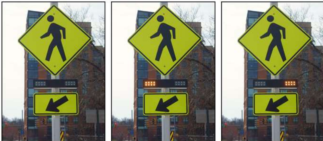
Figure 6. Example of RRFB dark (left) and illuminated during the flash period (center and right) mounted with a W11-2 sign and W16-7P plaque at an uncontrolled marked crosswalk.

An RRFB will consist of two rapidly and alternately flashed rectangular yellow displays having LED-array based pulsing light sources, and will be designed, located, and operated in accordance with the detailed requirements specified below.