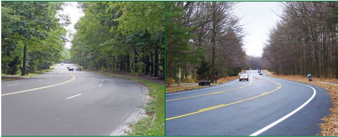
Figure 18. Before (left) and after (right) Road Diet