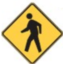
Figure 7a. Pedestrian Warning Sign (W11-2)