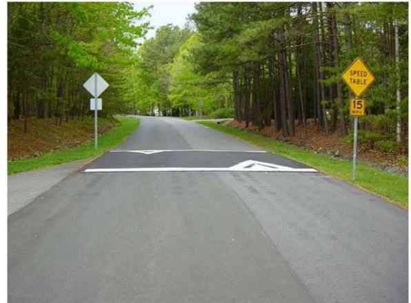
Figure 12. Speed Table

Refer to MUTCD Section 2C for signage of Speed Humps and Section 3B for Speed Hump markings and advance Speed Hump markings. Refer to the Vertical Speed Control Elements section of the NACTO (National Association of City Transportation Officials) Urban Street Design Guide for design guidance on Speed Humps and Speed Tables.