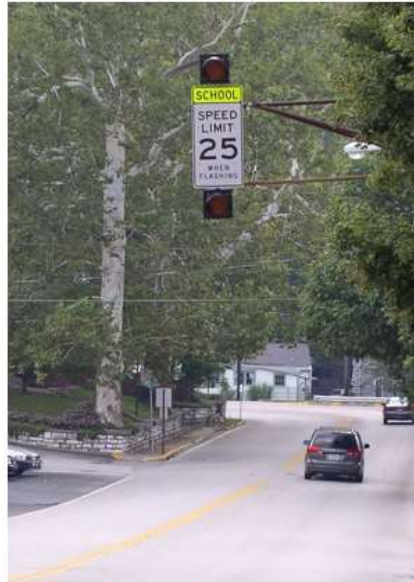
Figure 2. Overhead school flasher Speed Limit Sign

For added visibility, a second School Speed Limit Sign Beacon may also be located on the left side of the approaching roadway. For even more emphasis, the School Speed Limit Sign Beacon sign may be mounted overhead over the approximate center of the approach.