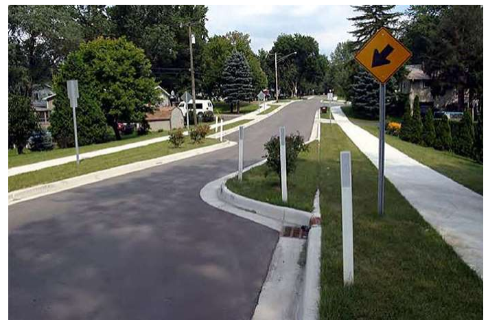
Figure 16. Choker