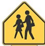
Figure 7b. School Sign (S1-1)