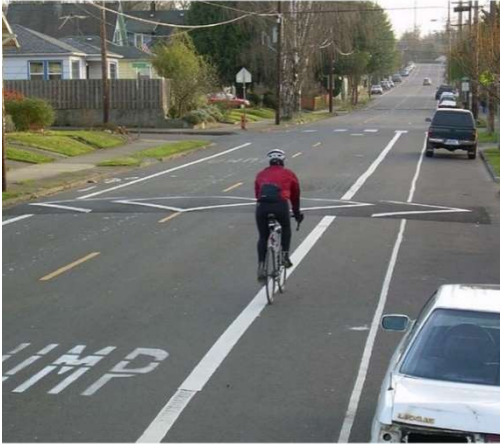
Figure 11. Speed Hump

Speed Humps should not be used on roads with steep grades. Colored or specialized paving materials may be used to enhance the aesthetics of the Speed Hump. Speed Humps may coordinate with mid-block crossings to provide a safer crossing for pedestrians.